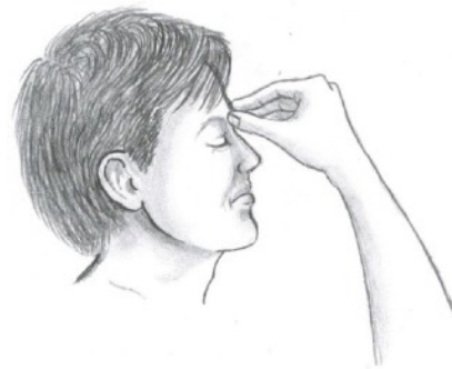
Right Hand High Bridge