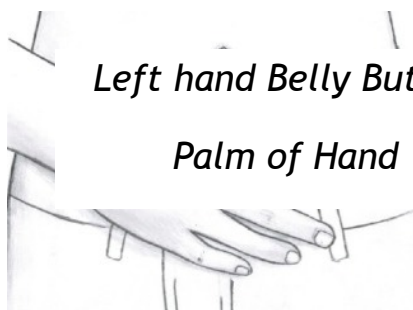
Left hand Belly Button