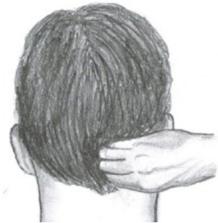
Right Hand Brainstem