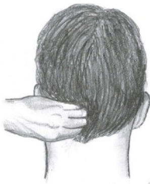
Left Hand Brainstem